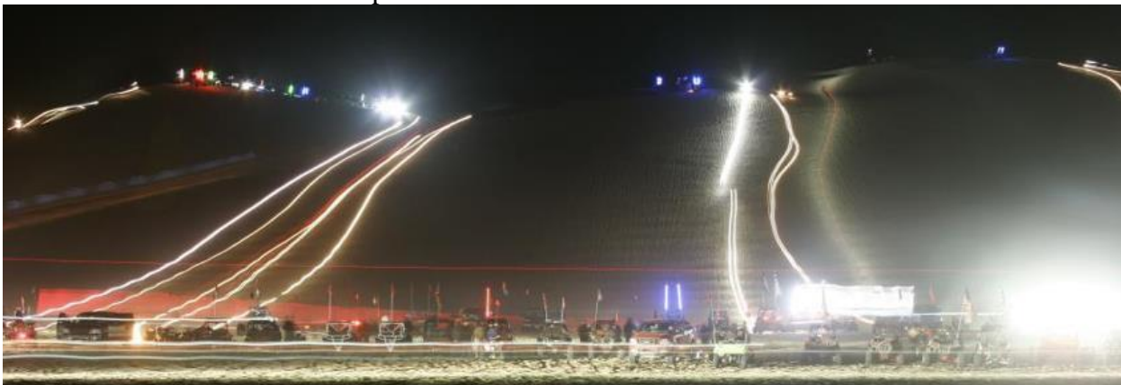
Figure 1 - Oldsmobile Hill, 2013

Imperial Sand Dunes Recreation Area Management Plan - Three protests are currently being addressed at the Washington Office. Once protests have been successfully resolved, a Record of Decision will be released to the public.